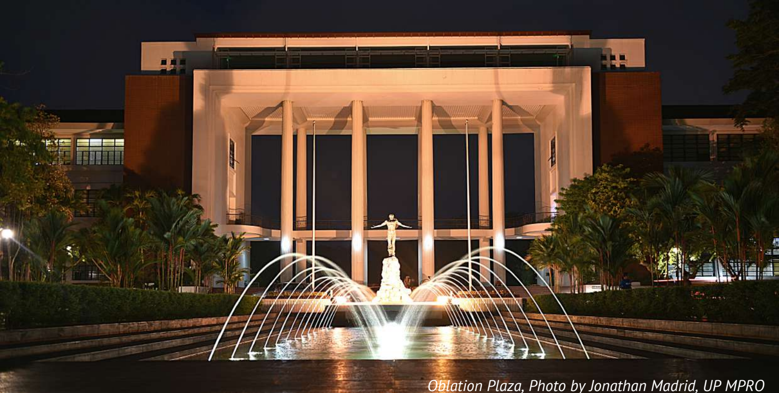
Oblation Plaza

UP accepts foreign exchange students from partner universities around the world. These inbound students should be officially nominated by their home university based on their own set criteria for selecting exchange students. Students may choose to enroll to any UP Constituent Universities (CU) as long as the courses the students will be taking are available in that UP CU.